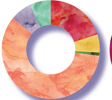
Where Funds Come From

59% Government 20% Private Contributions 7% Program Service Fees 7% Other Sources 6% Special Events 1% United Way